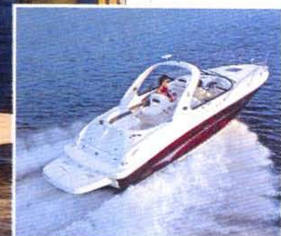
The 30-foot Sea Ray yacht—which was unveiled in Mumbai by Marine Solutions in 2006 is worth a crore